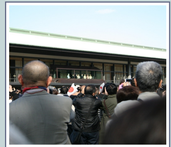
[above] Outside the Imperial Palace. The Emperor and his family came out to greet

The biggest challenge I faced while studying abroad was homesickness. I had never been away from my family for longer than 3 weeks, but I was also missing my friends. Trying to be comfortable with all new people in a new country took time, and while we were all friendly, it did not feel the same as having people I was used to being around for years. I struggled a bit with the first month. However, eventually I was able to cope with the homesickness and finally enjoy myself. It also was very beneficial for me because it made me more independent. I made new friends with people in different countries, and I am now hoping to visit my roommate from the program in Spain where she lives, and see our other friends in Europe as well.