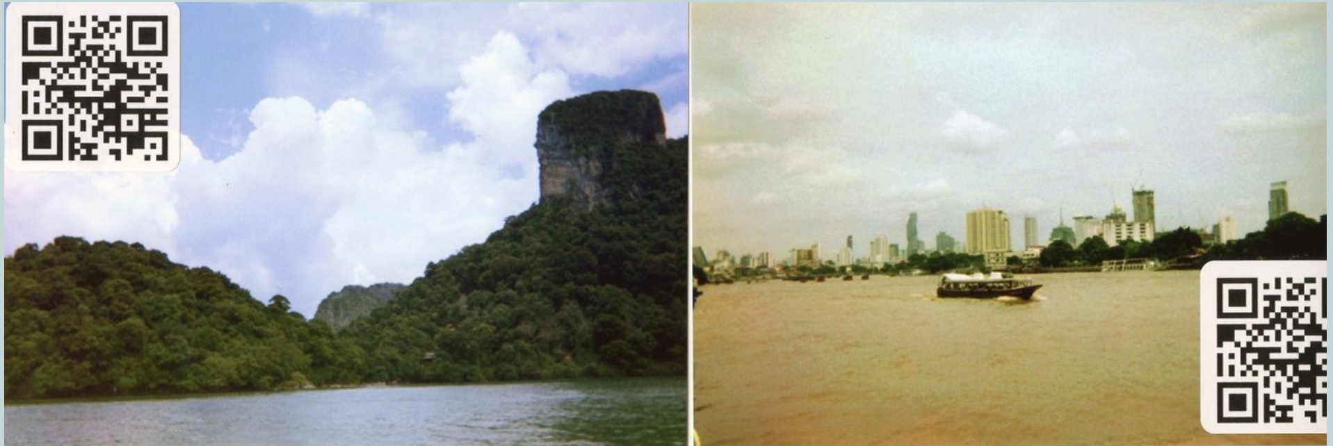
[above] Images with QR code produced as part of the author's independent research project on Royal Barges, and as project to encourage students to study abroad. QR code links to author's blog.

Especially in a globally-focused discipline like Anthropology, travel and experience abroad is a professional, educational and empirical augmentation. I witnessed several social science-majoring (and other) people blossom both individually and socially while abroad. Pursue your subdiscipline abroad! There are many, many options.