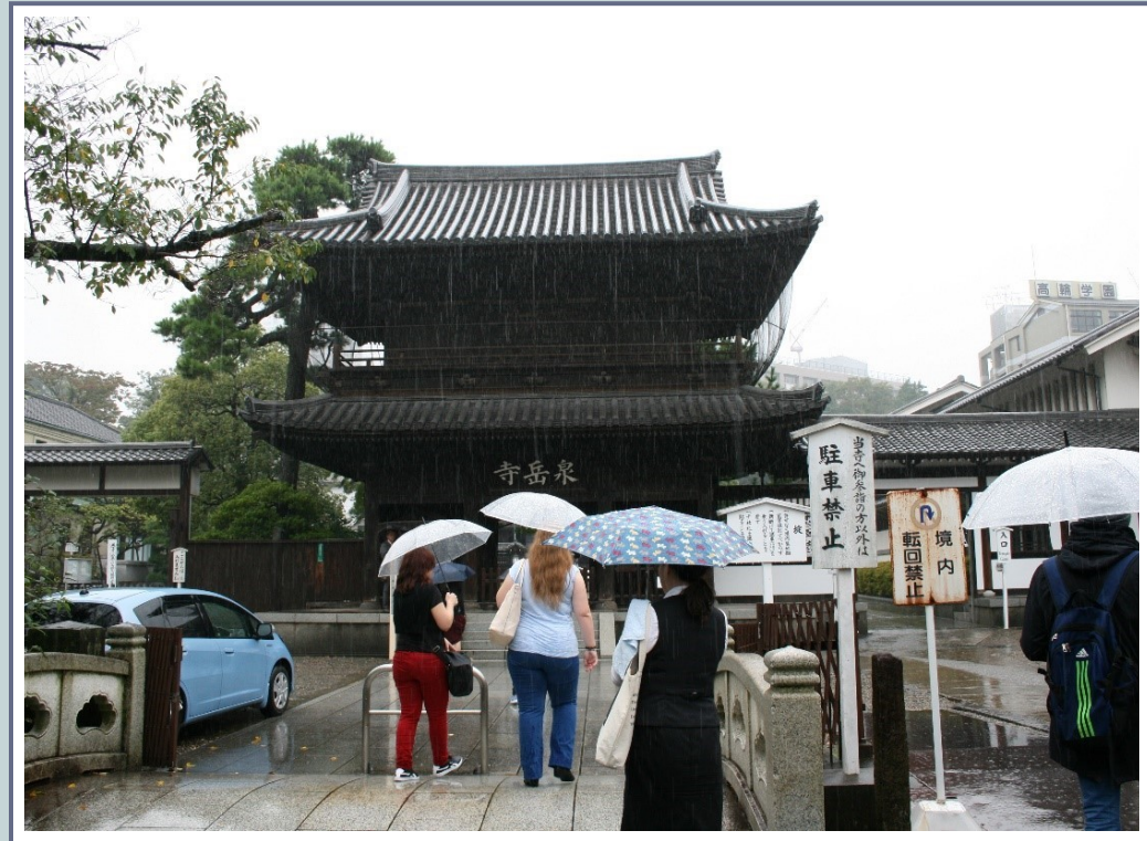
[above] Field trip for class to the Temple of the 47 Ronin, Sengaku-ji.

While traveling alone, paperwork for applying and processing to be an international student, getting homesick, and experiencing a lot of unexpected events was scary and stressful for me, I do not regret the path I chose. I have a lot of precious memories, more knowledge, and new friends from all over the world now and I highly recommend studying abroad to anyone and everyone. Stepping out of your comfort zone can be fun sometimes! Education abroad broadens your knowledge of the world and as an anthropology majors it is a good experience and opportunity to be able to live and study or familiarize yourself with new cultures, while still earning credits for school. Some programs might even offer a course where you can do an independent research study, or you can take classes to practice your language skills! The possibilities are endless if you research your programs, especially if you feel that it may be financially difficult to do. There is aid out there for students, or smaller programs that might only require you to pay for travel and living expenses. For myself in the end, despite going on a education abroad trip, it costed about the same (and a little less!) than if I had never left and stayed at UCR for all 4 years. I was able to still graduate in 4 years, and graduated a couple of months after returning from Japan. Do your research and have safe travels!